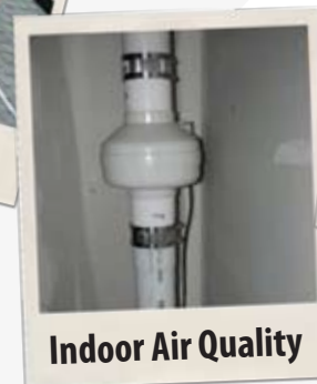
Indoor Air Quality