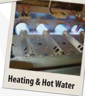
Heating & Hot Water